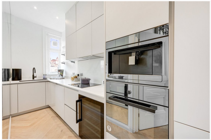
BEAUFORT GARDENS, LONDON, SW3 £2,850,000 SHARE OF FREEHOLD

AN EXCEPTIONAL NEWLY REFURBISHED LATERAL APARTMENT SPANNING THE SECOND FLOOR OF AN ATTRACTIVE DOUBLE-FRONTED PERIOD BUILDING.