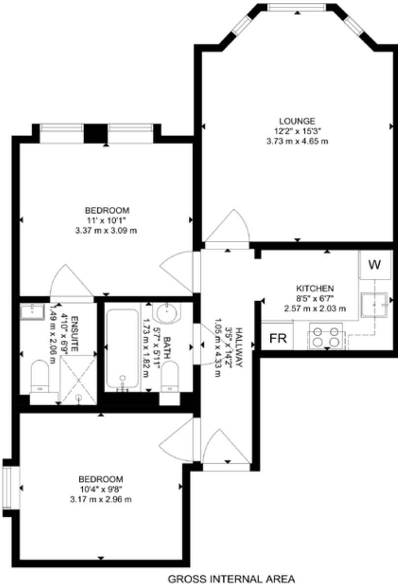
TOTAL: 656 SQ FT, 61 m<sup>2</sup> SIZE AND DIMENSIONS ARE APPROXIMATE, ACTUAL MAY VARY