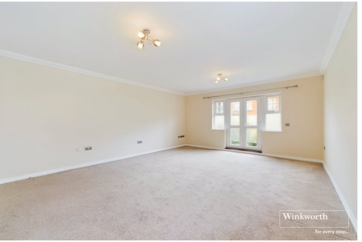
ROSE BATES DRIVE, KINGSBURY, LONDON, NW9 OFFERS IN EXCESS OF £365,000 LEASEHOLD