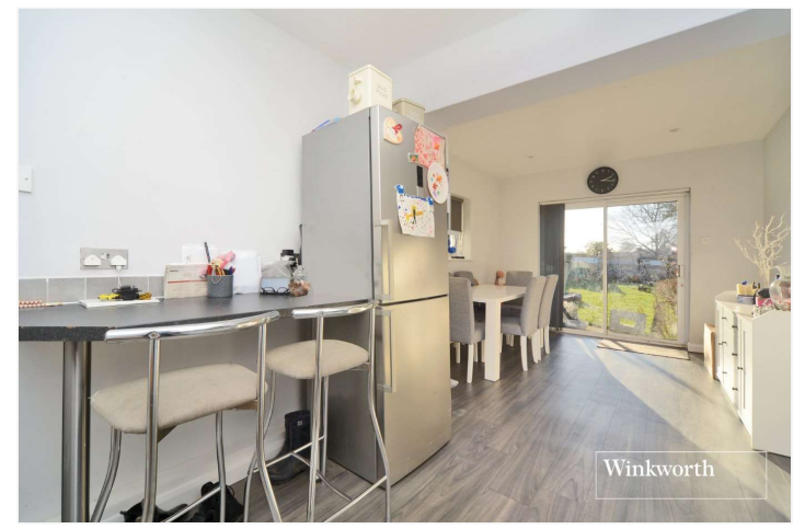
BROWNING AVENUE, WORCESTER PARK, KT4 £525,000 FREEHOLD

A LOVELY THREE BEDROOM PROPERTY WITH A SUBSTANTIAL SOUTHERLY ASPECT 100FT APPROX REAR GARDEN IDEALLY LOCATED CLOSE TO WORCESTER PARK HIGH STREET