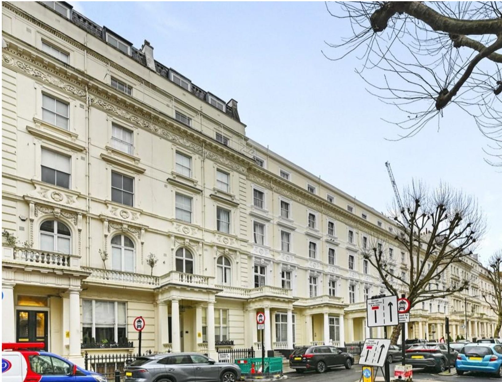
INVERNESS TERRACE, W2 £850,000 SHARE OF FREEHOLD