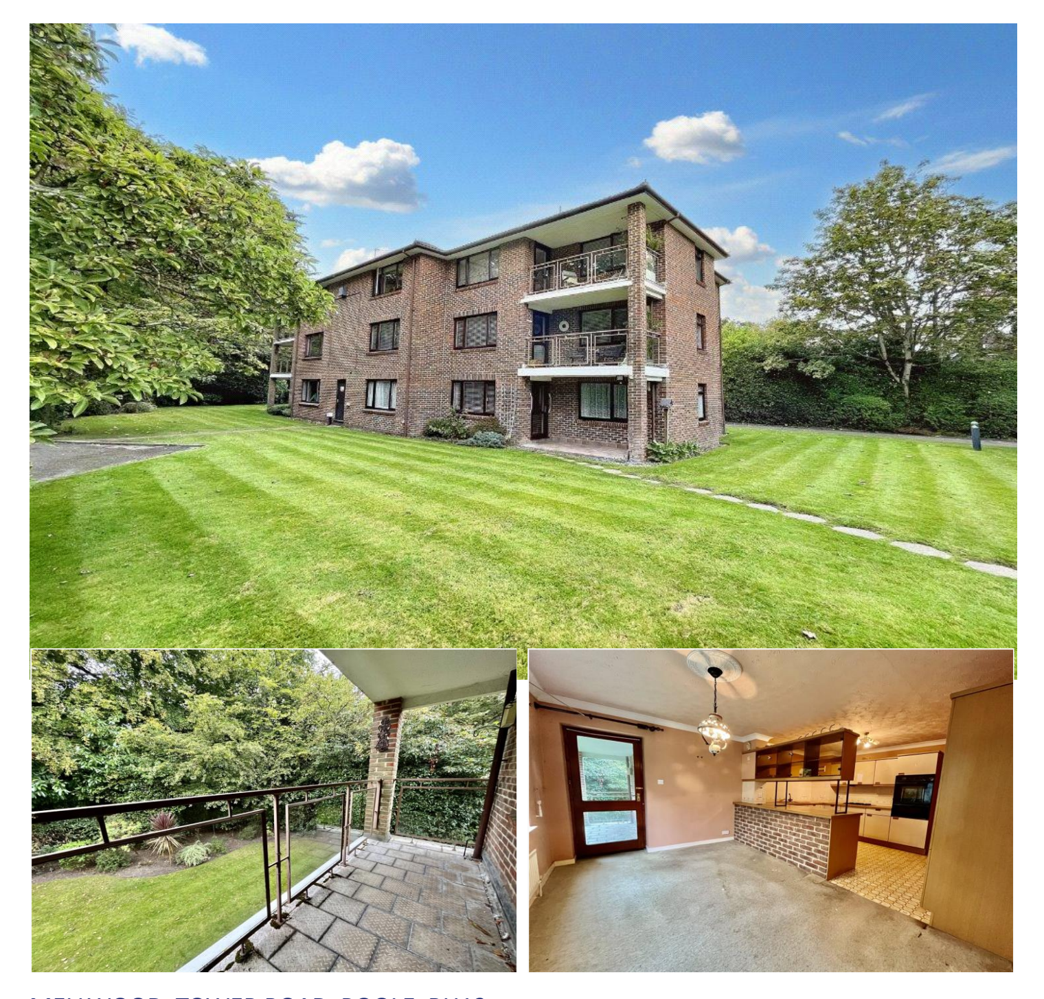
MELLWOOD, TOWER ROAD, POOLE, BH13