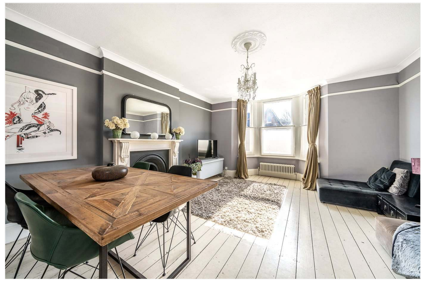
THERAPIA ROAD, EAST DULWICH, SE22 £385,000 SHARE OF FREEHOLD