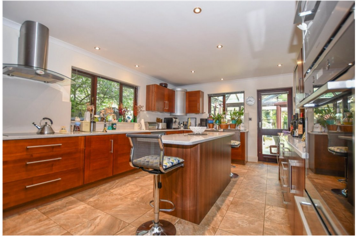
23 ASHDALE PARK, FINCHAMPSTEAD, WOKINGHAM, BERKSHIRE, RG40 3QS £1,200,000 FREEHOLD

THIS BEAUTIFULLY PRESENTED FOUR-BEDROOM DETACHED FAMILY HOME SITS TUCKED AWAY IN A QUIET CUL-DE-SAC WITHIN THE HIGHLY REGARDED ASHDALE PARK DEVELOPMENT IN FINCHAMPSTEAD