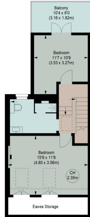
SECOND FLOOR (45.42 m 2 )

The floor plan is not to scale and measurements and areas shown are approximate and therefore should be used for illustrative purposes only. The plan has been prepared in accordance with the RICS code of Measuring Practice and whilst we have confidence in the information produced, it must not be relied on. If there is any aspect of particular importance, you should carry out or commission your own inspection of the property.