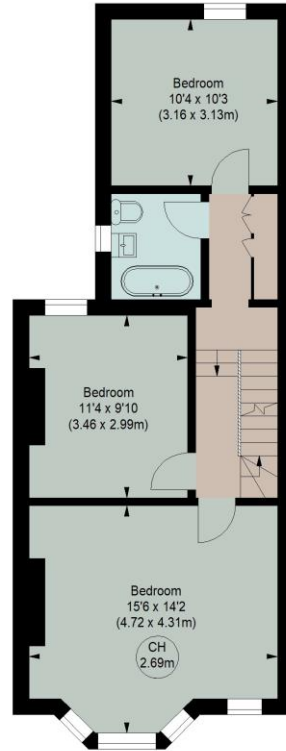
FIRST FLOOR (52.92 m 2 )