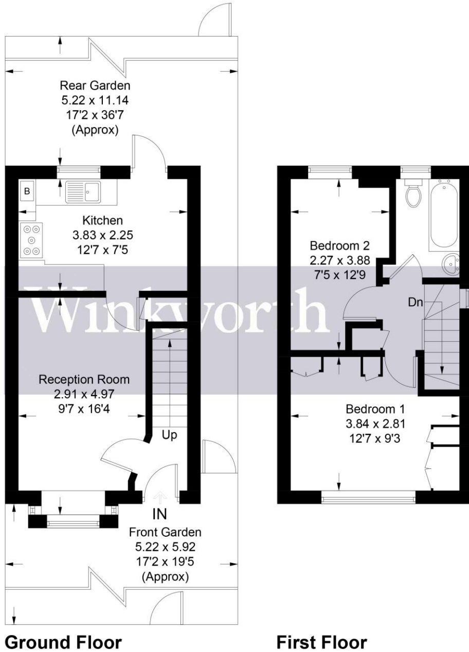
Illustration for identification purposes only, measurements are approximate, not to scale. Winkworth © 2023 (ID964706)

Approximate Gross Internal Area = 54.9 sq m / 591 sq ft