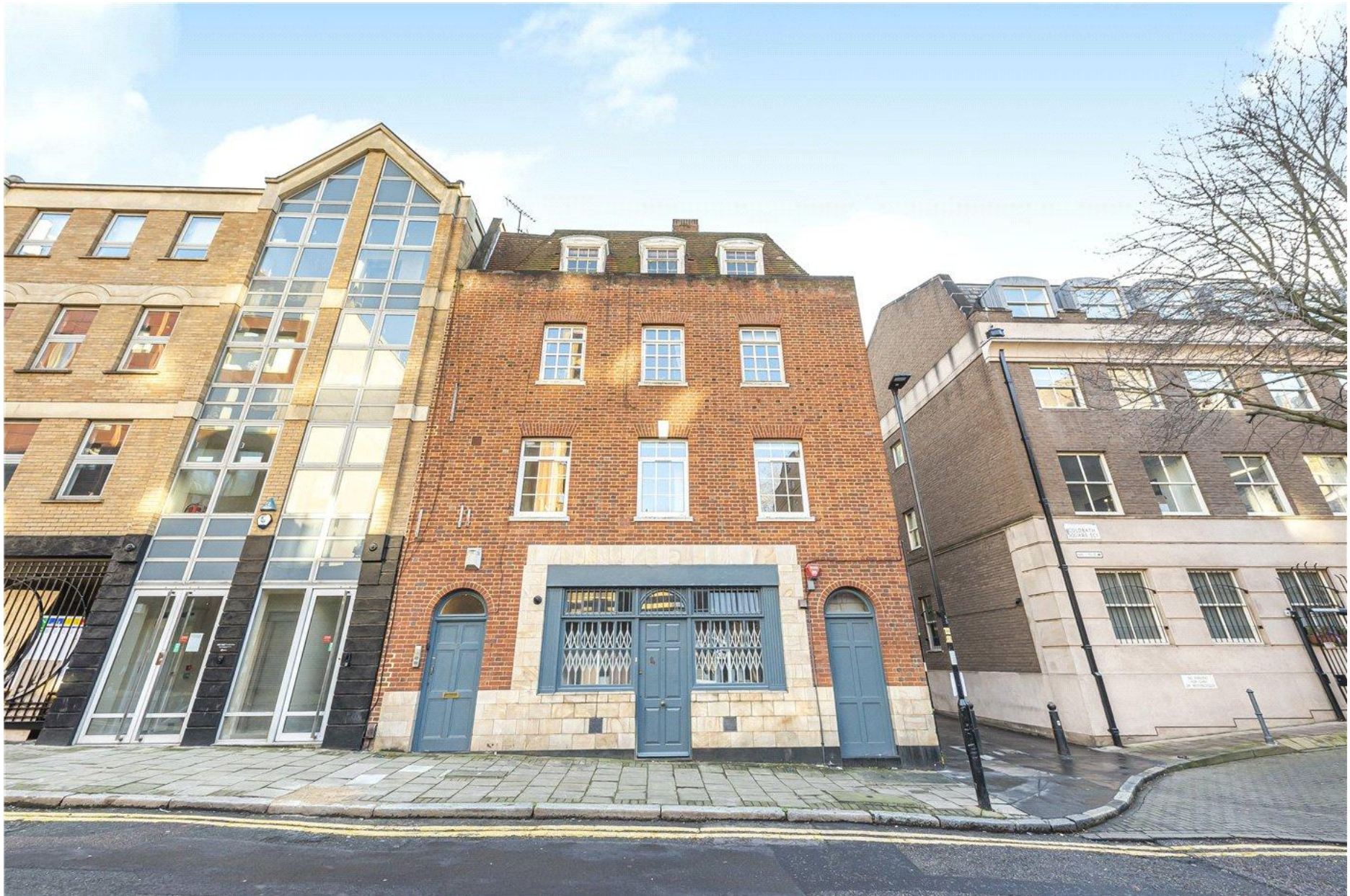
TOPHAM STREET, EC1R £500,000 LEASEHOLD