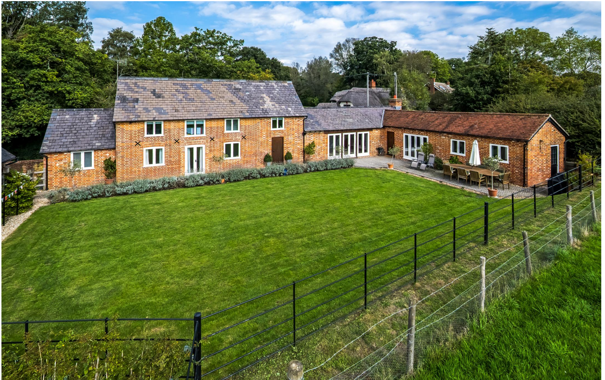
Newport Farm, Newport Lane, Braishfield, Romsey, SO51 0PL