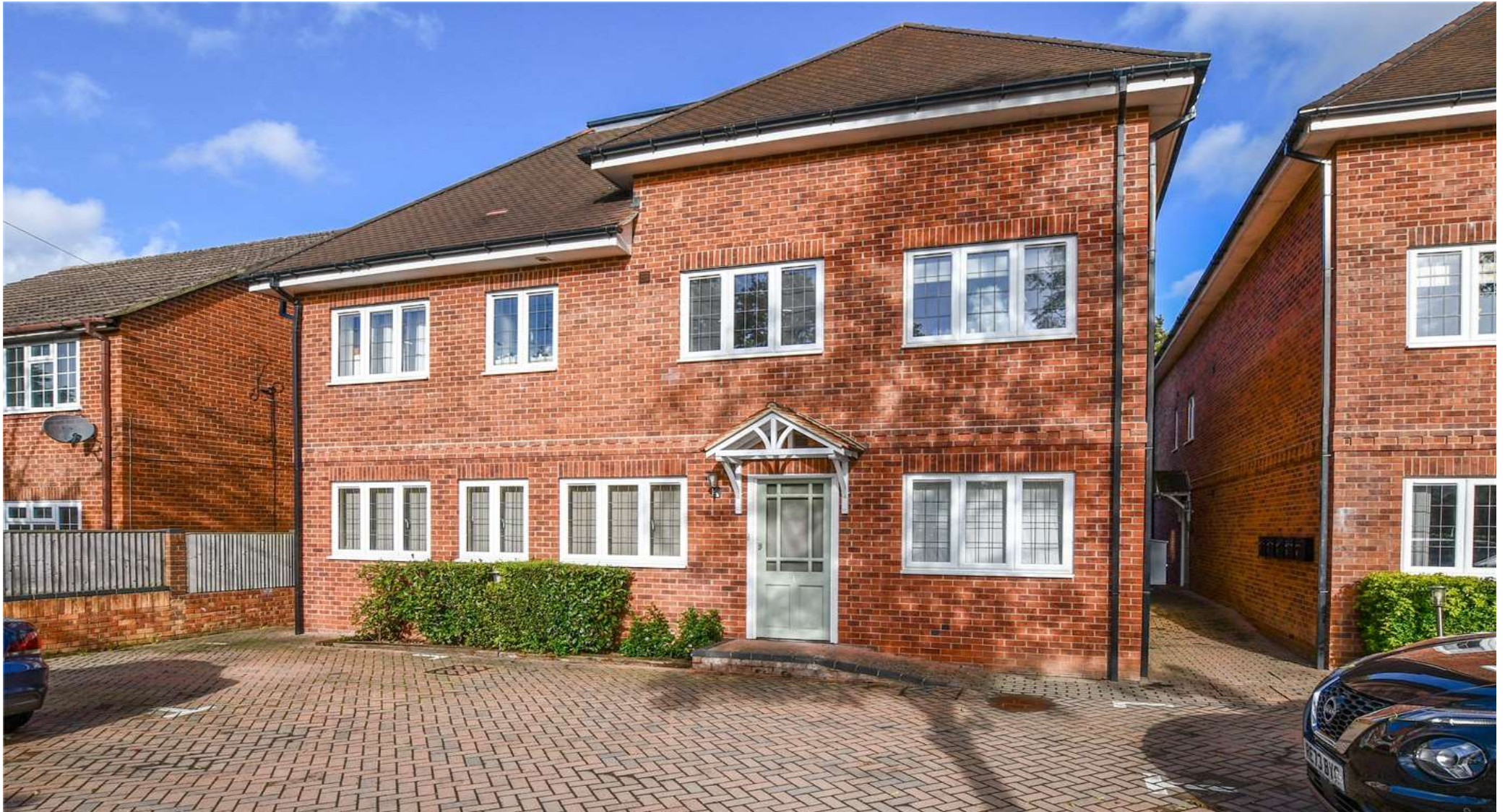
FLAT 1, 449 READING ROAD, WINNERSH, WOKINGHAM, BERKSHIRE, RG41 5HX £205,000 LEASEHOLD