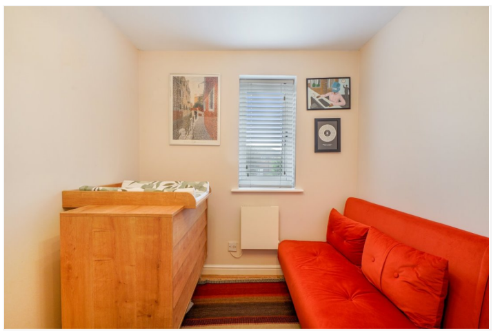
WINDMILL DRIVE, GOLDERS GREEN, NW2 £375,000 LEASEHOLD