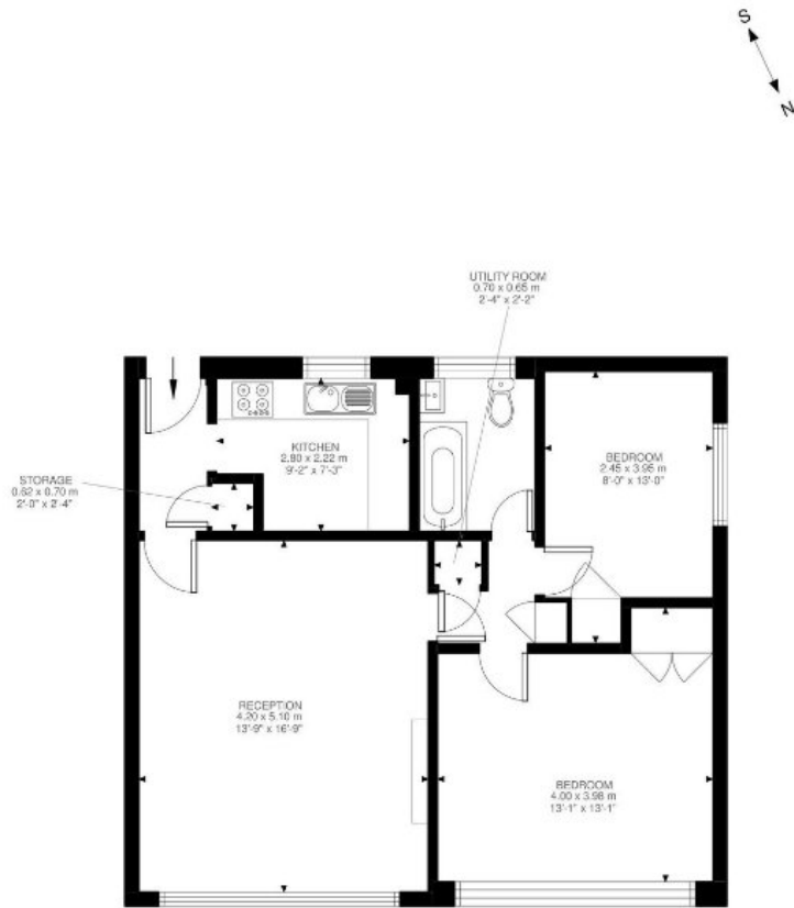
Lower Ground Floor 680 ft 2

South Norwood Hill, SE25 Approximate Gross Internal Area 63.14 SQ.M / 680 SQ.FT