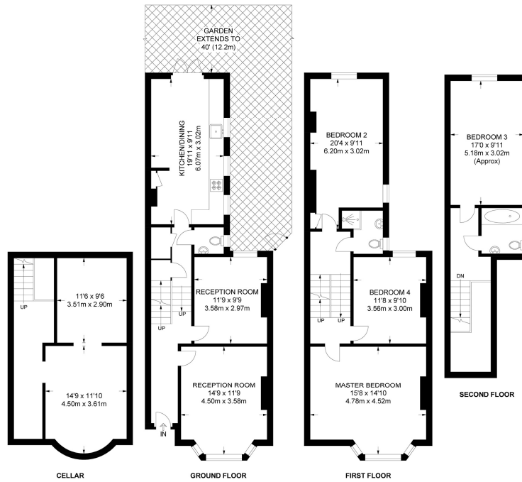
APPROXIMATE GROSS INTERNAL AREA WITH CELLAR: 2004 SQ FT / 186.2 SQ M

This floorplan is for illustration purposes only and is not to scale. The position and size of doors, windows, appliances and other features are approximate.