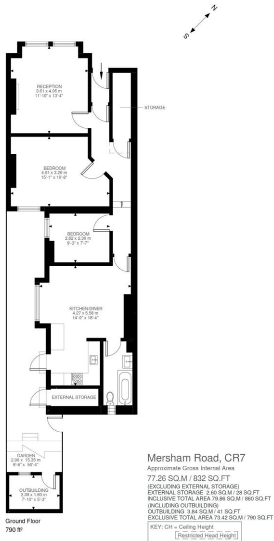
Illustration for identification purposes only. Not to scale. Floor Plan Drawn According To RICS Guidelines.