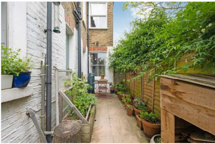
PLAYFIELD CRESCENT, EAST DULWICH, SE22 OIEO £600,000 SHARE OF FREEHOLD