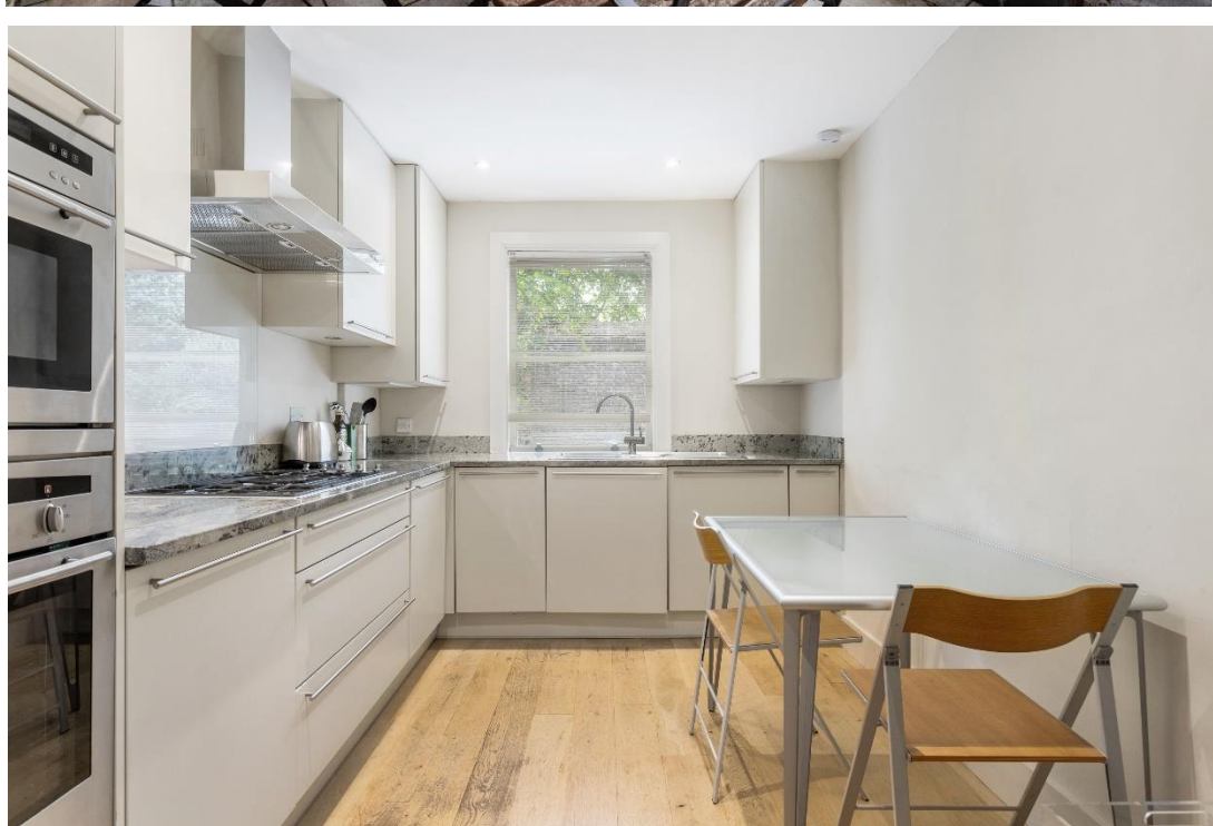
Excellent Condition | Private Terrace | Raised Ground Floor