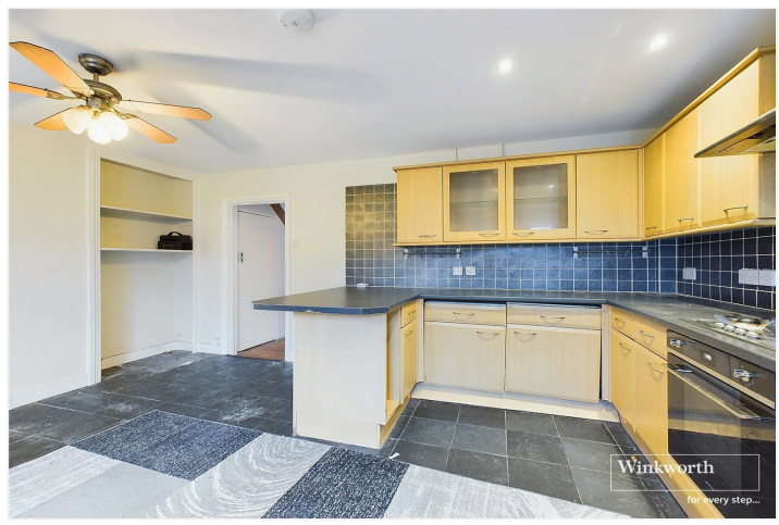
WALDECK STREET, READING, RG1 GUIDE PRICE £325,000 FREEHOLD

A LARGER THAN AVERAGE THREE BEDROOM VICTORIAN TERRACE HOUSE IN THIS QUIET NO THROUGH ROAD A SHORT WALK TO READING TOWN CENTRE