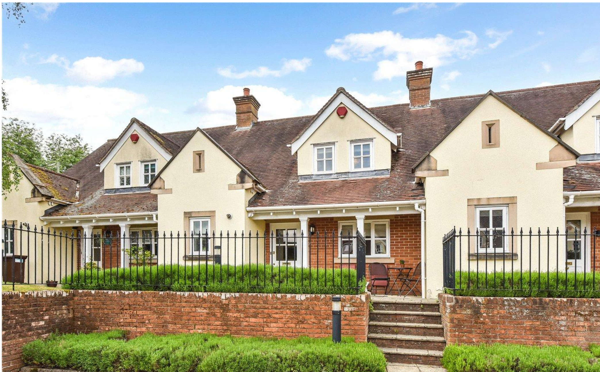
Abbotts Lea Cottages, Worthy Road, Winchester, Hampshire, SO23 7HB