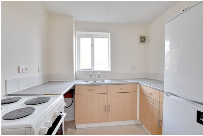
RUSTON ROAD, SE18 £235,000 LEASEHOLD

WE ARE PLEASED TO OFFER THIS TWO BEDROOM, 2ND FLOOR, MODERN APARTMENT THAT MEASURES CIRCA 551 SQ FT AND WOULD MAKE A PERFECT BUY TO LET INVESTMENT. ALSO LOCATED MOMENTS FROM THE RIVER AND MAINLINE RAIL!