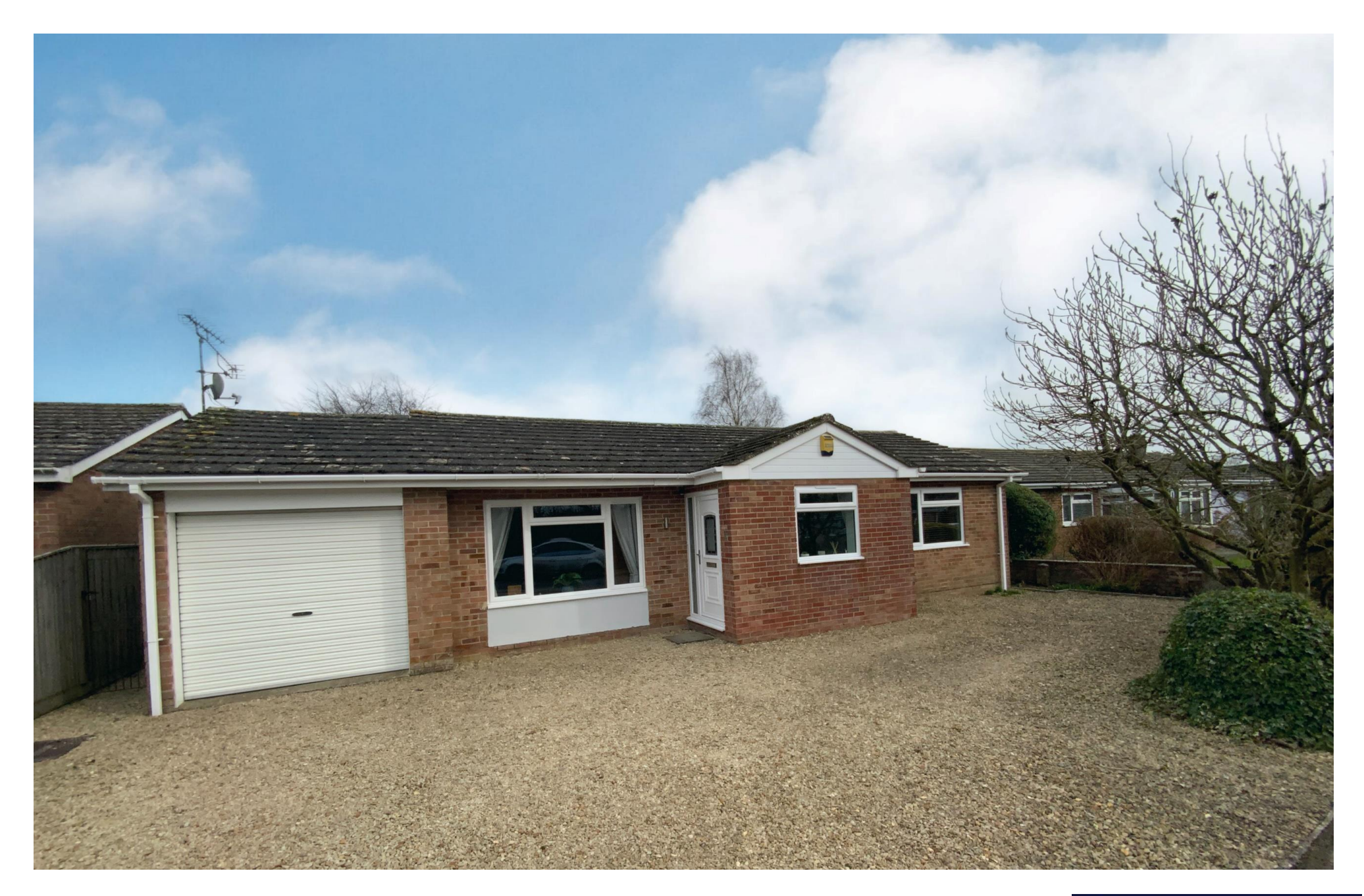
Beautifully Presented Extended Detached Bungalow