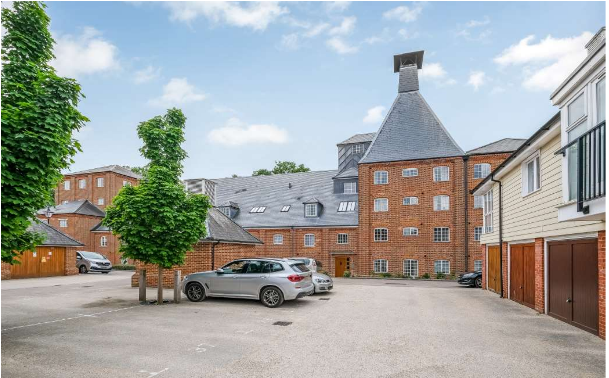
The Malthouse, Brewery Lane, Romsey, Hampshire, SO51 8JX