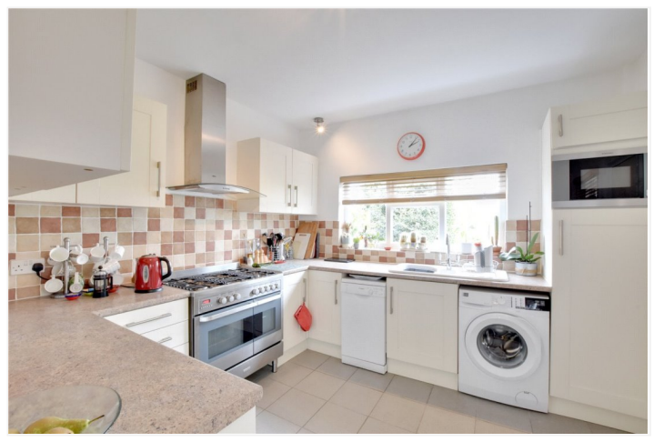
HEATHWOOD GARDENS, CHARLTON, LONDON, SE7 £850,000 FREEHOLD

A BEAUTIFULLY PRESENTED FOUR BEDROOM FAMILY HOME THAT IS PERFECTLY LOCATED ON THIS QUIET AND SUPREMELY POPULAR ROAD, JUST EAST OF CHARLTON VILLAGE, AND CLOSE TO WOOLWICH DOCKYARD MAINLINE RAIL. MEASURING C2407 SQ FT!