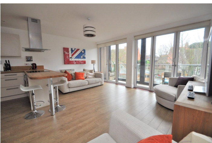
THE ROPE WALK, CANTERBURY, CT1 £1,400 PER MONTH

Canterbury | 01227 456 645 | canterbury@winkworth.co.uk