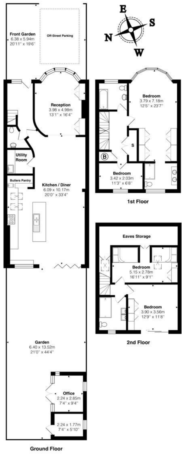
Total Area: 203.6 m² ... 2192 ft² (excluding garden, front garden)