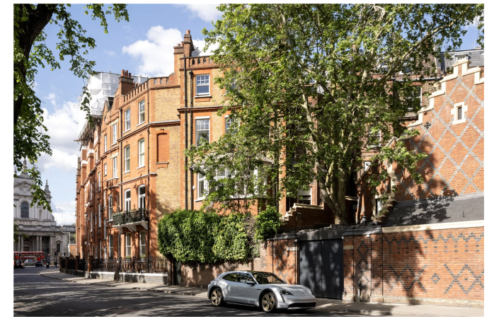
EGERTON GARDENS, SW3 £4,950,000