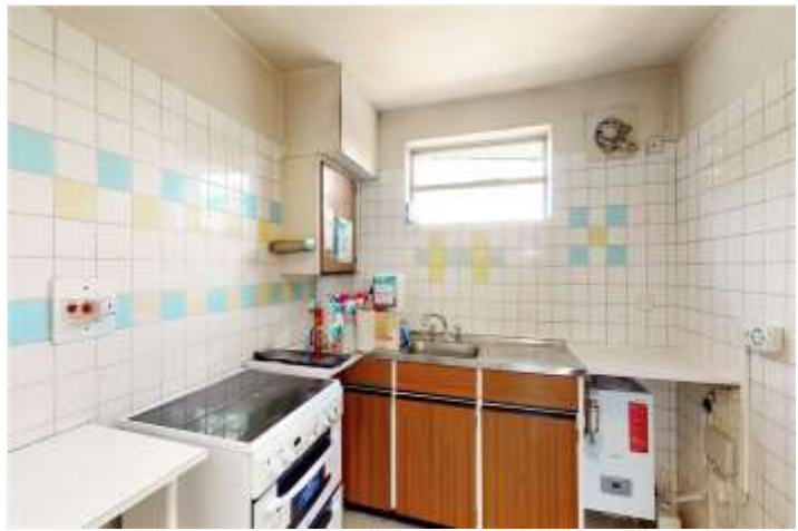
THE CHESTNUTS, GREAT NORTH ROAD, N2 £280,000 LEASEHOLD

A RARE OPPORTUNITY TO PURCHASE A ONE BEDROOM PROPERTY IN THE AREA WITH AN ASKING PRICE STARTING WITH A "2". IT IS A VERY-WELL PROPORTIONED TOP FLOOR APARTMENT WITH A PRIVATE BALCONY AND GARAGE TOO.