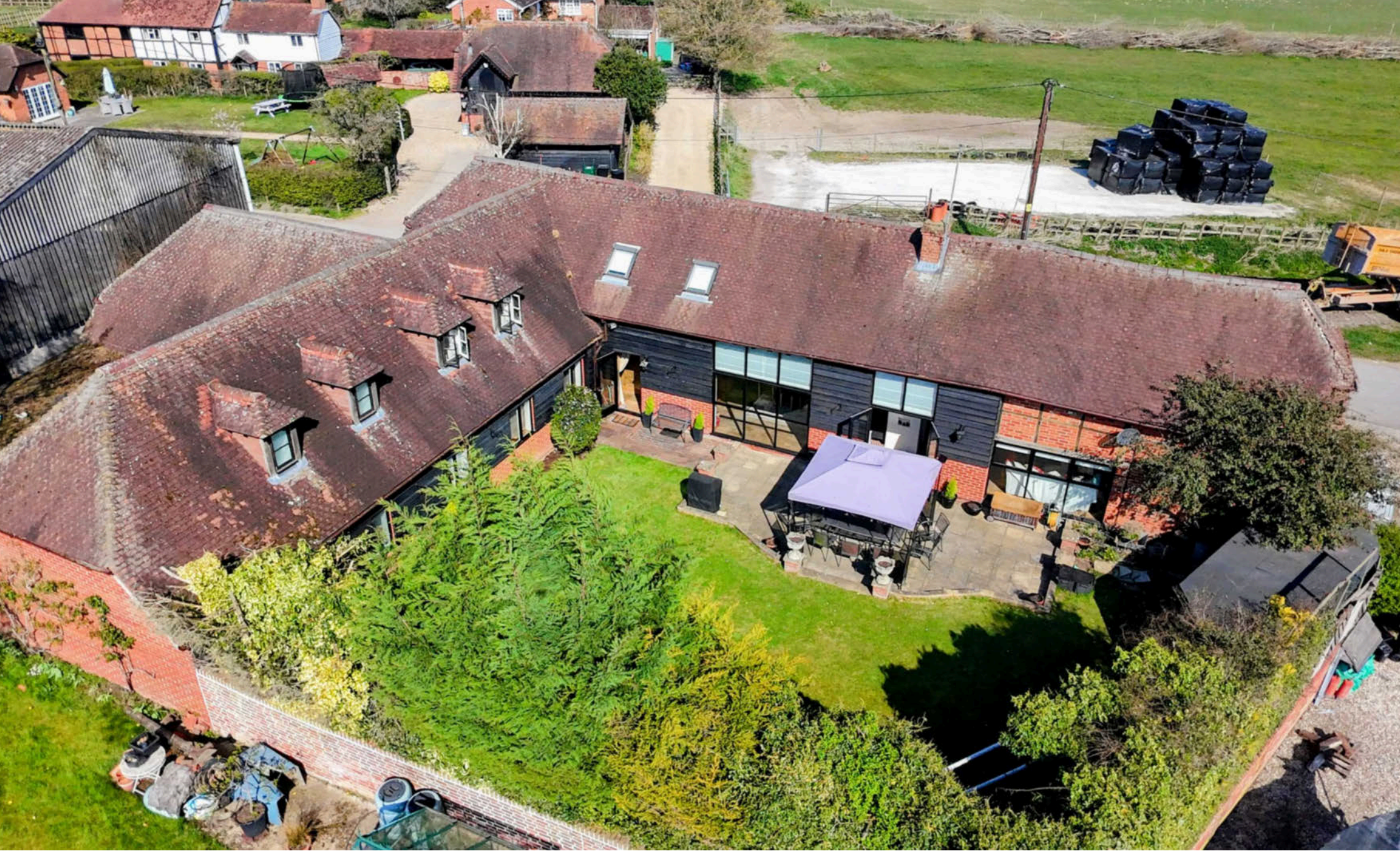
SNOOKS BARN CHURCH LANE, FARLEY HILL, READING, BERKSHIRE, RG7 1UP