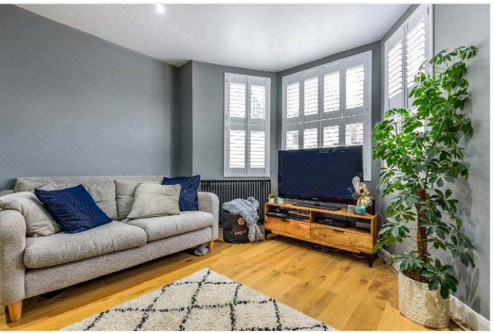
LORDSHIP LANE, EAST DULWICH, SE22 OFFERS IN EXCESS OF £575,000 LEASEHOLD