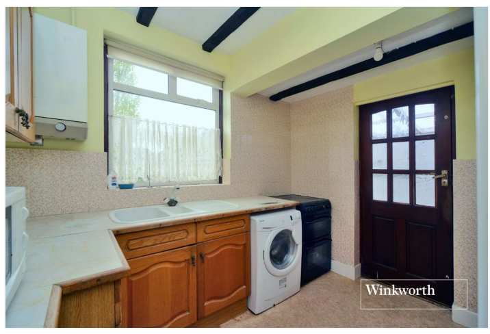
OAKS AVENUE, WORCESTER PARK, KT4 £650,000 FREEHOLD

AN APPEALING THREE BEDROOM SEMI-DETACHED FAMILY HOME LOCATED ON A HIGHLY SOUGHT AFTER ROAD AND OFFERING SIGNIFICANT SCOPE FOR EXTENSION STPP