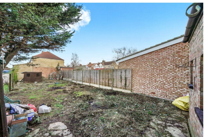
HARROW VIEW, HARROW, MIDDLESEX, HA1 £575,000 FREEHOLD