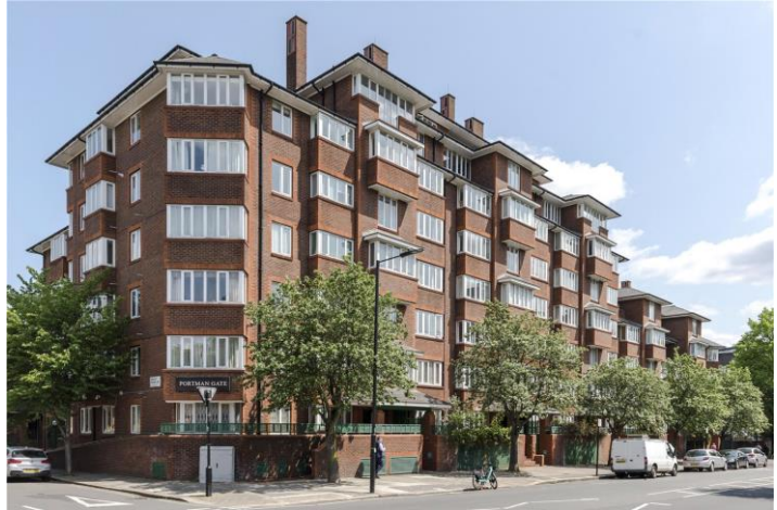
PORTMAN GATE, LISSON GROVE, MARYLEBONE, NW1 OFFERS IN EXCESS OF £495,000 SHARE OF FREEHOLD

LOCATED WITHIN THE POPULAR PORTMAN GATE - NW1, A MODERN SECURE PORTERED DEVELOPMENT, LOCATED ON THE VIBRANT LISSON GROVE. A RECENTLY MODERNISED, THIRD FLOOR (WITH LIFT), WELL PROPORTIONED, ONE BEDROOM APARTMENT, WITH A SHARE OF FREEHOLD AND A SELECTION OF DEVELOPMENT AMENITIES.