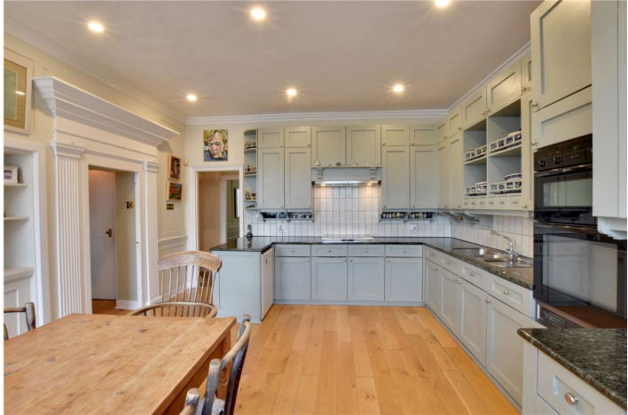
DARTMOUTH ROW, GREENWICH, LONDON, SE10 £3,250,000 FREEHOLD

RARE TO THE MARKET IS THIS QUITE STUNNING FOUR BEDROOM, THREE STOREY, QUEEN ANNE HOUSE, BUILT CIRCA 1690, THAT IS GRADE II LISTED AND FEATURES AN OUTSTANDING AND LARGE WESTERLY FACING GARDEN, PLUS WONDERFUL VIEWS ACROSS LONDON. PERFECTLY LOCATED ON THIS QUIET AND BEAUTIFUL TREE LINED ROAD JUST OFF THE HEATH! MEASURING CIRCA 2522 SQ FT.