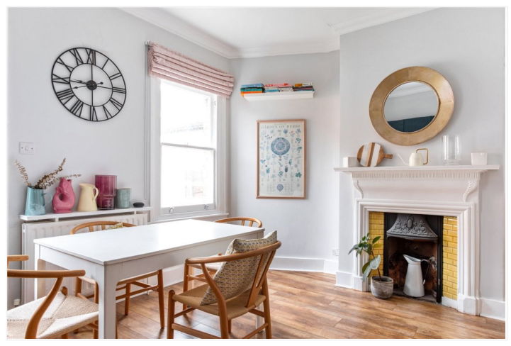
MEDFIELD STREET, SW15 £1,750 PER MONTH FURNISHED

A superb one bedroom first floor flat with a roof terrace finished to an incredibly high standard throughout