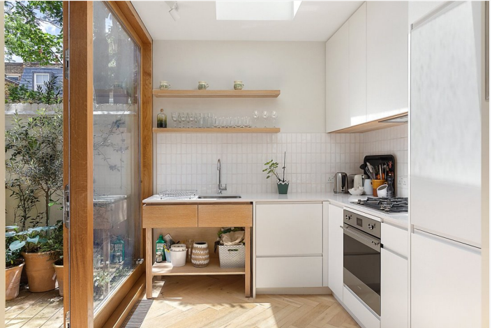
PEMBROKE PLACE, W8 £995,000 SHARE OF FREEHOLD

A CHARMING AND TOTALLY REFURBISHED ONE BEDROOM GARDEN FLAT SITUATED ON THE GROUND FLOOR OF A PERIOD BUILDING LOCATED IN AN ATTRACTIVE CUL DE SAC CLOSE TO KENSINGTON HIGH STREET AND HOLLAND PARK.