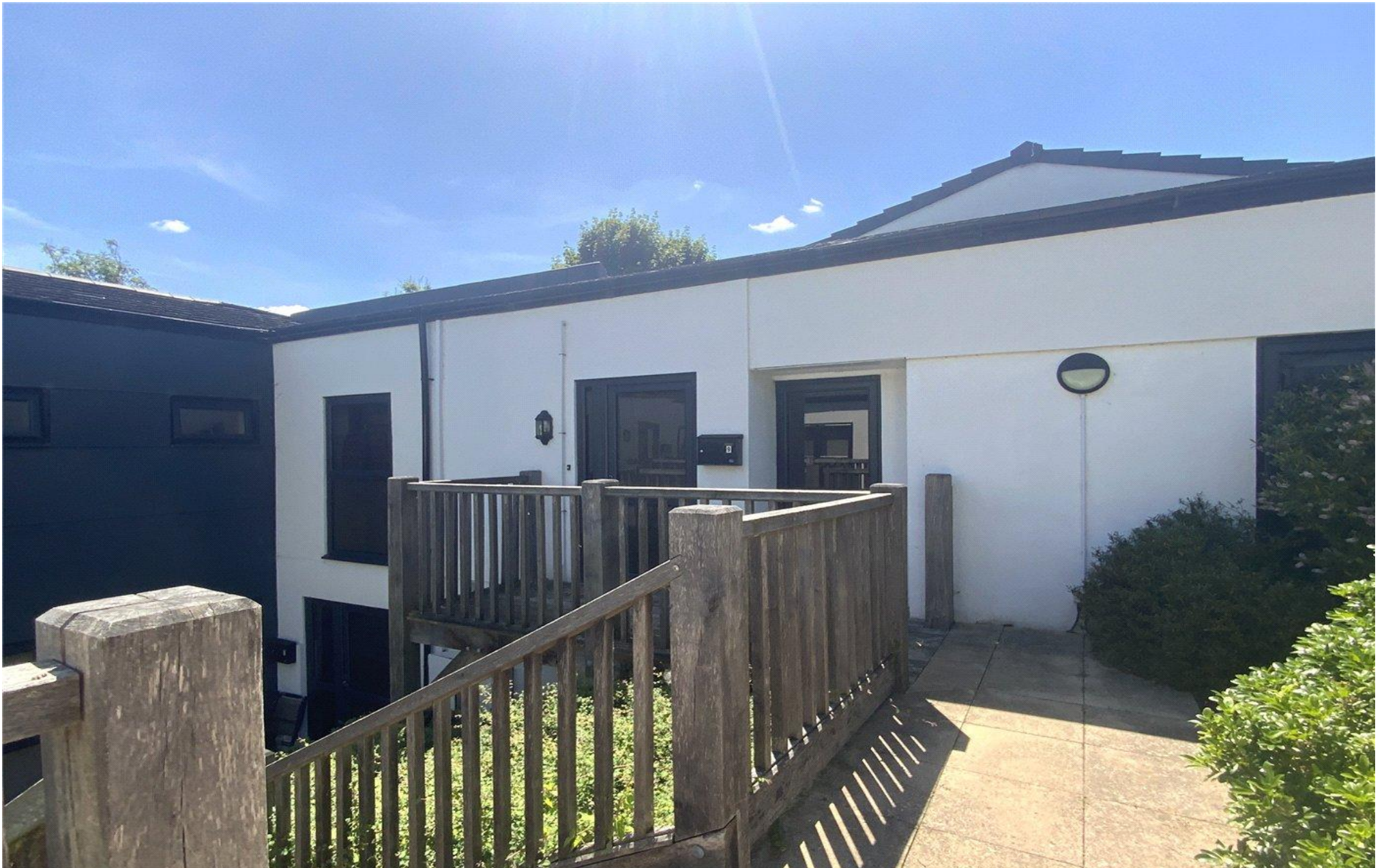
Modern Two bedroom Apartment £270,000