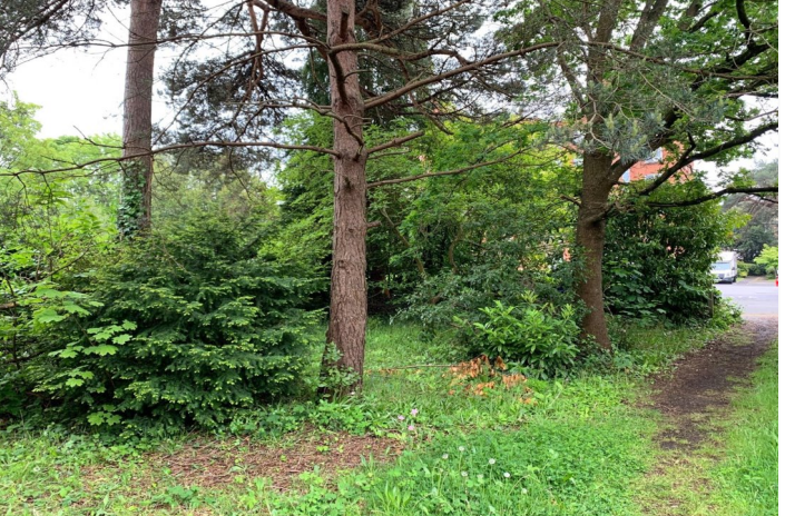
PRINCESS ROAD, BRANKSOME, POOLE, DORSET, BH12