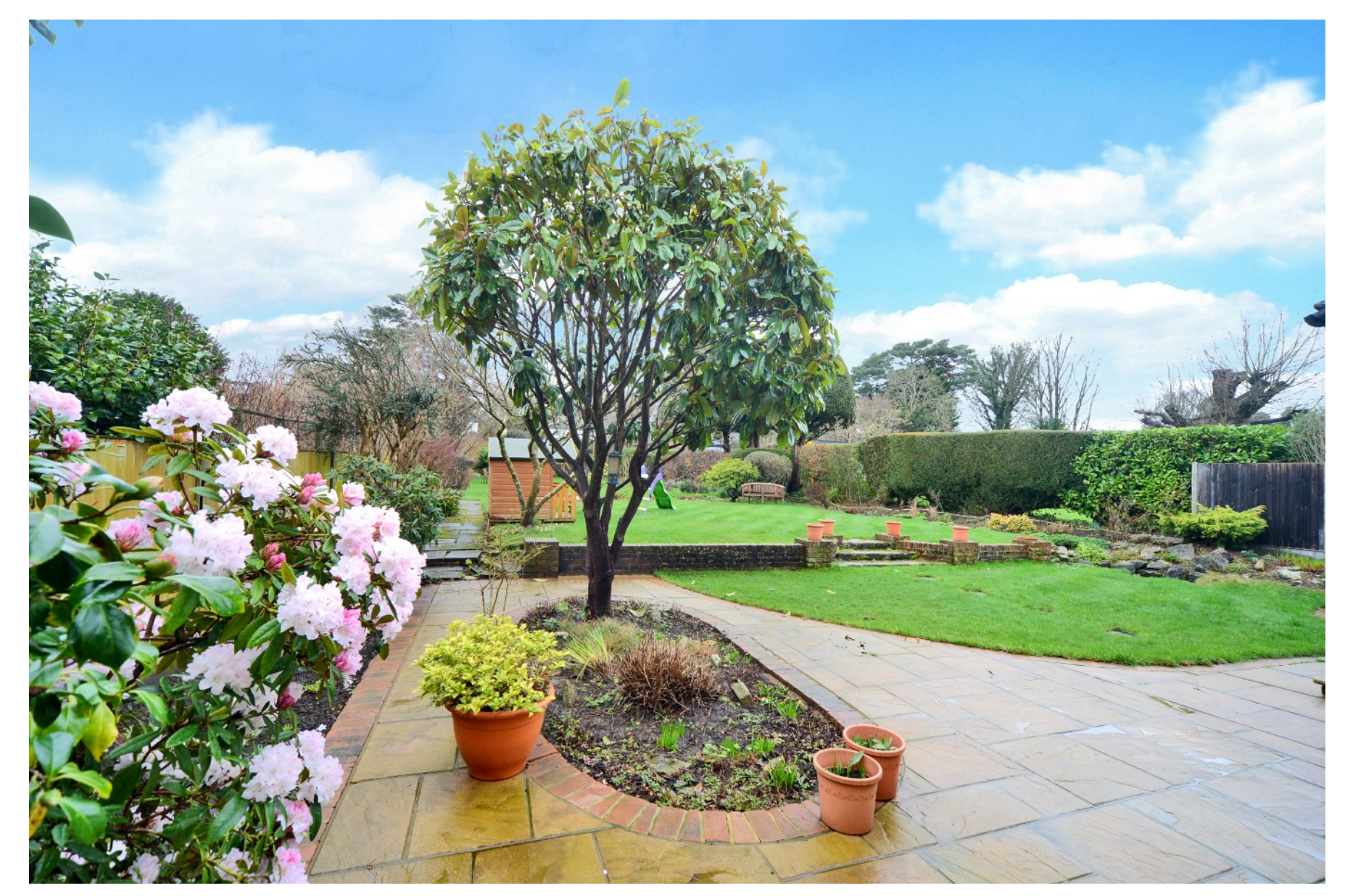
Under the Consumer Protection Regulations 2008, these Particulars are a guide and act as information only. All details are given in good faith and are believed to be correct at time of printing. Winkworth give no representation as to their accuracy and potential purchasers or tenants must satisfy themselves by inspection or otherwise as to their correctness. No employee of Winkworth has authority to make or give any representation or warranty in relation to this property.