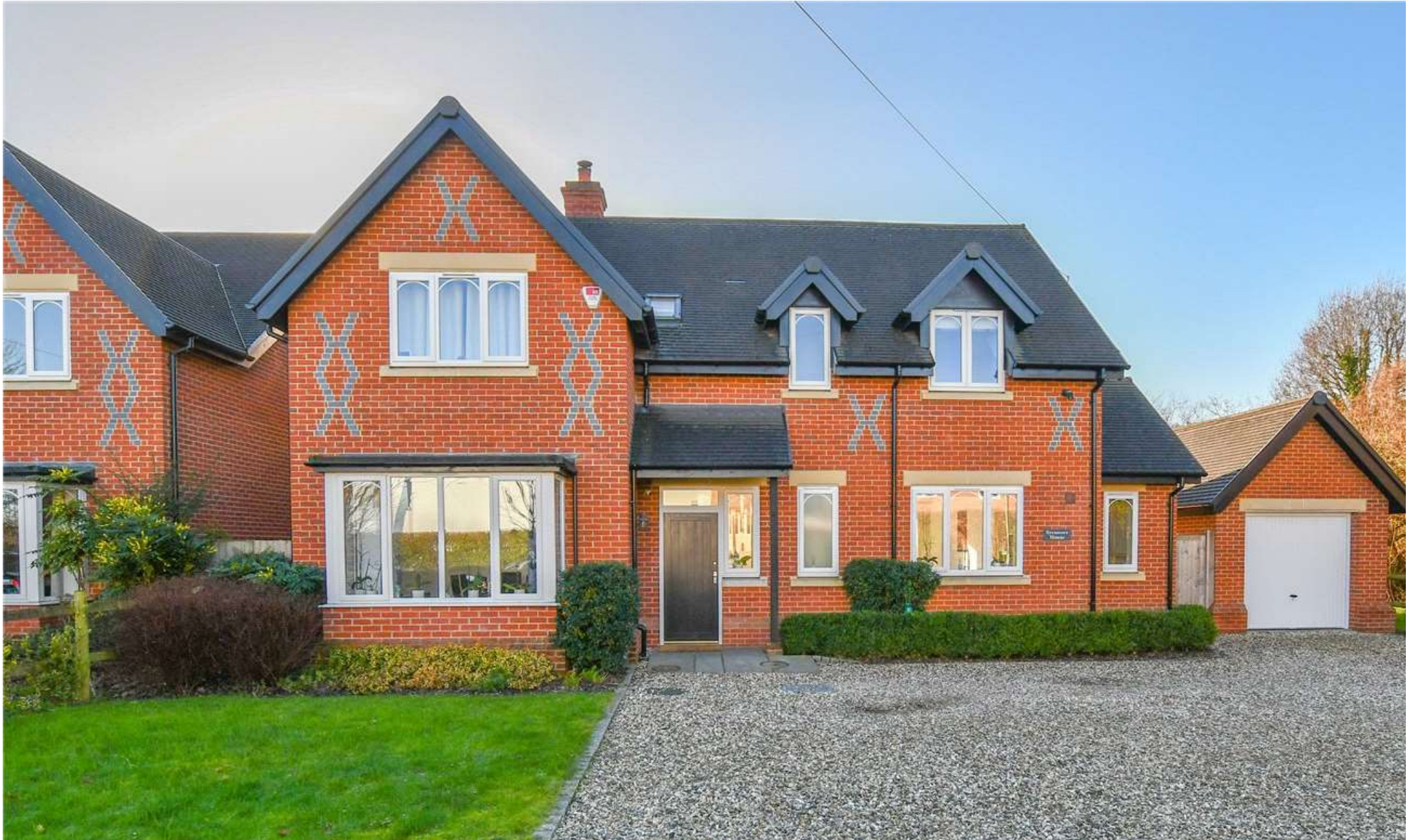
SYCAMORE HOUSE, NEW ROAD, SINDLESHAM, WOKINGHAM, BERKSHIRE, RG41 5DX £975,000 FREEHOLD