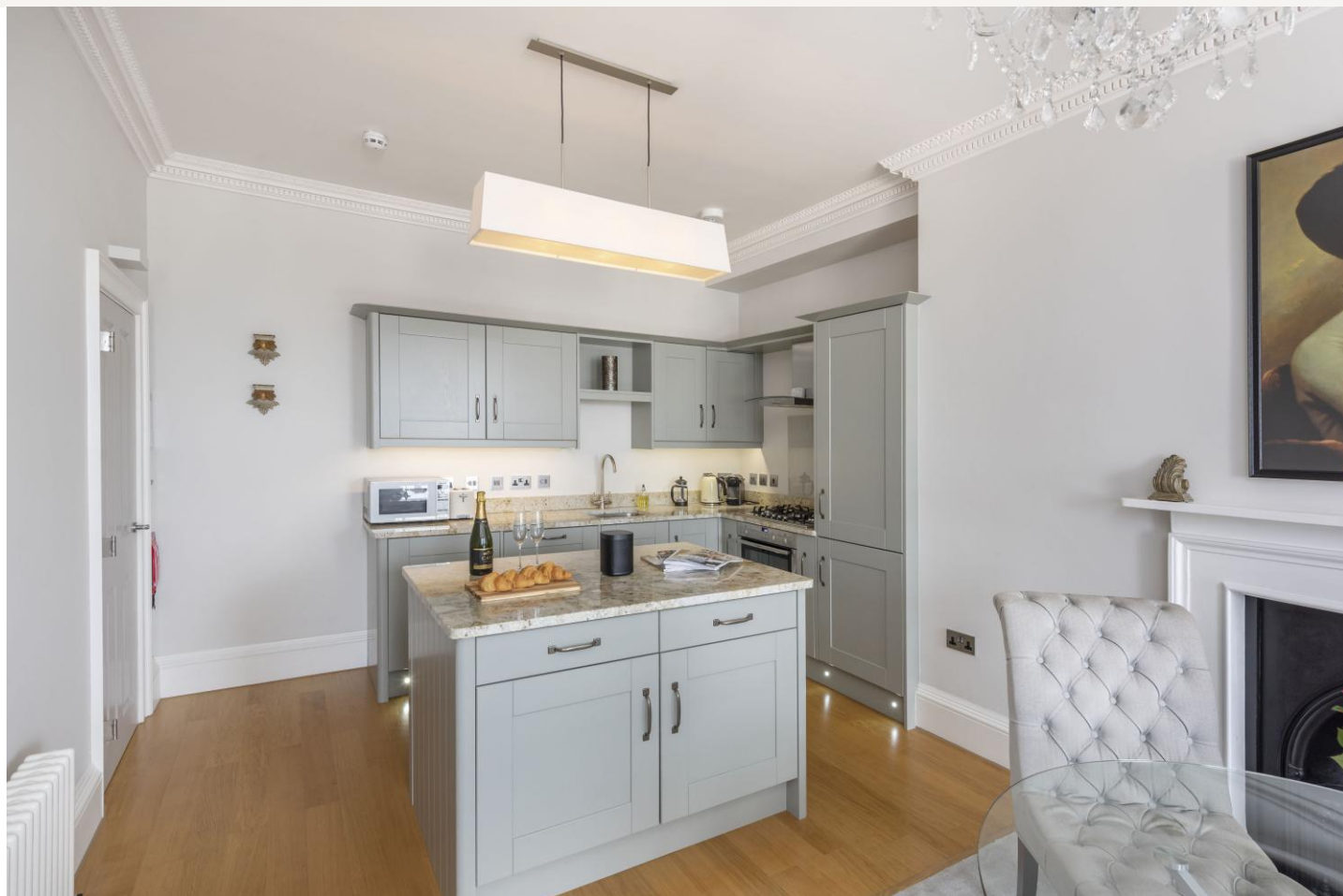
3 Brunswick Place, Bath BA1 2RQ Gross Internal Area (Approx.) Total Area = 68 sq m / 731 sq ft