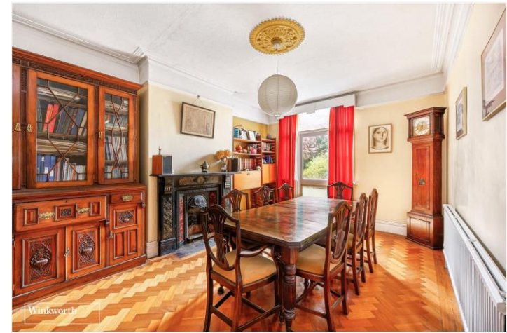
STILE HALL GARDENS, W4 £1,100,000 FREEHOLD