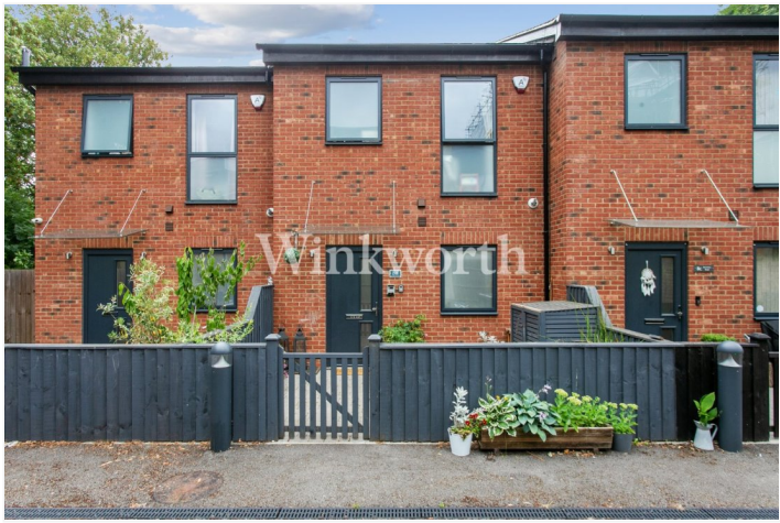
BROWNLOW ROAD, N11 £650,000 FREEHOLD

A STUNNING TWO BEDROOM HOUSE IDEALLY LOCATED FOR THOSE LOOKING FOR ACCESS INTO THE CITY AND THE WEST END.