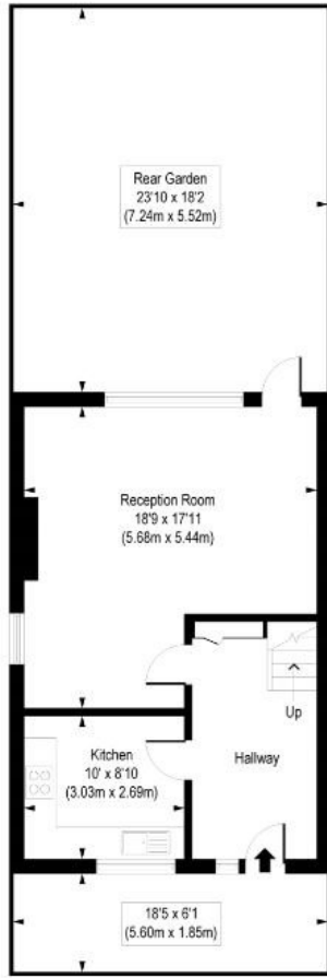
Ground Floor Gross Internal Floor Area 508 sq ft