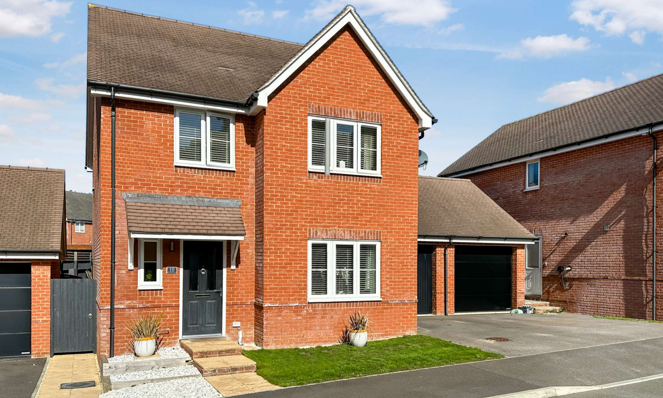
Horseshoe Crecent Ferndown BH22 9FX GUIDE PRICE £550,000