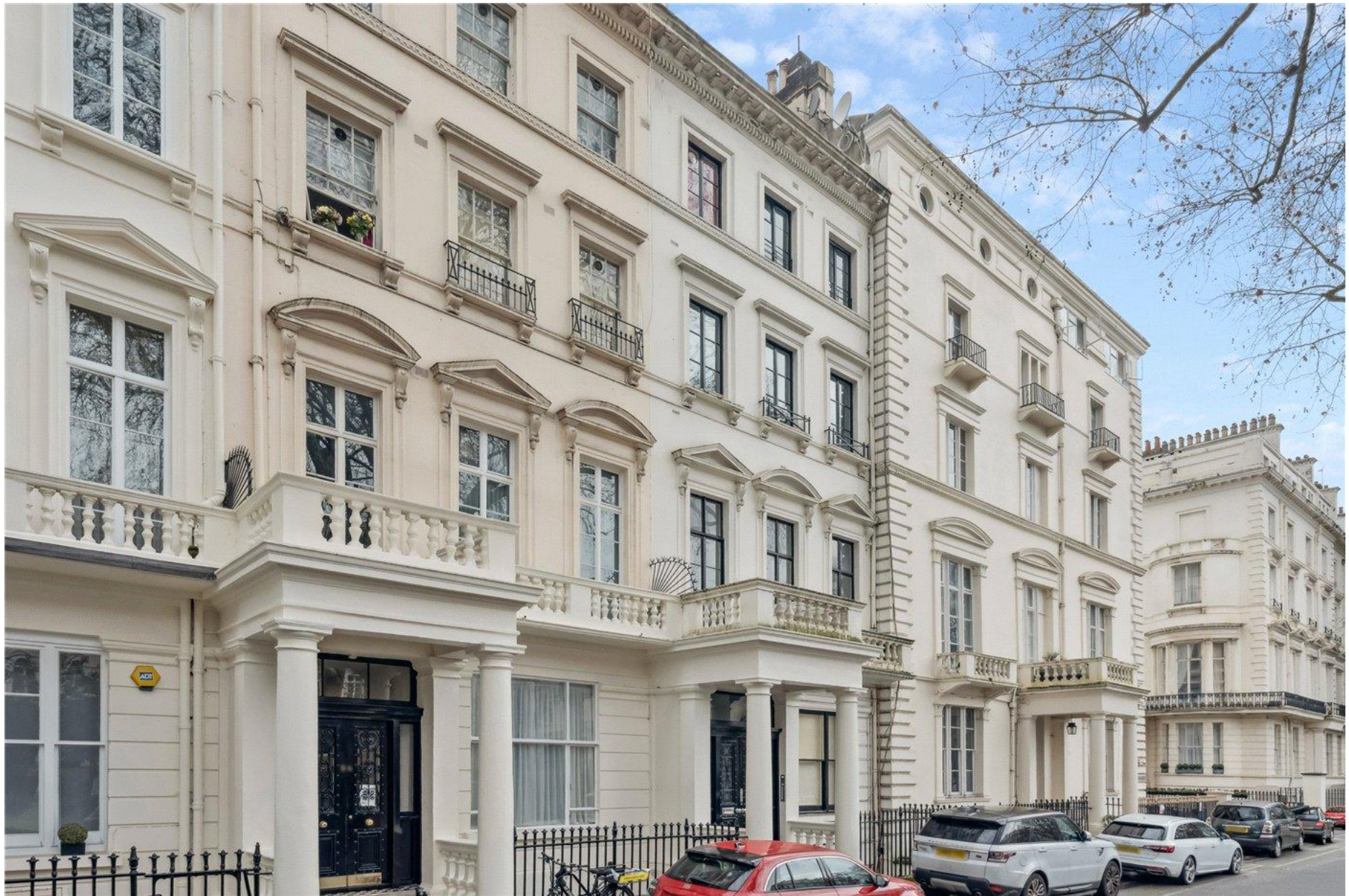
WESTBOURNE TERRACE, W2 £460,000 LEASEHOLD