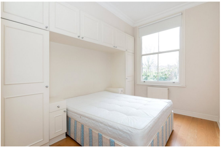
CHESTERTON ROAD, LONDON, W10 £2,600 PER MONTH FURNISHED , UNFURNISHED