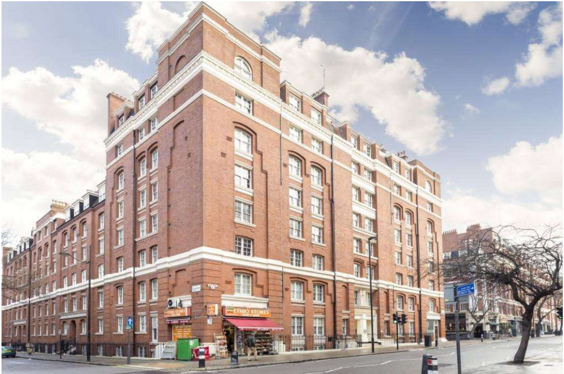
HASTINGS STREET, WC1H £475,000 LEASEHOLD