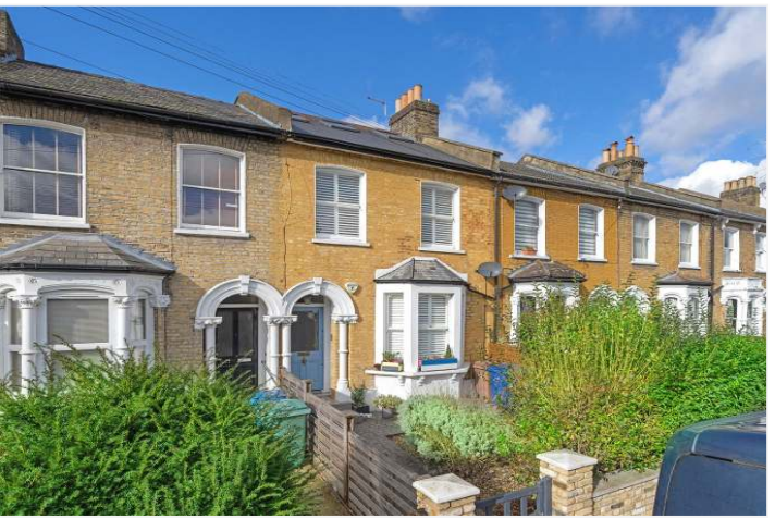
UPLAND ROAD, EAST DULWICH, LONDON, SE22 £1,350,000 FREEHOLD